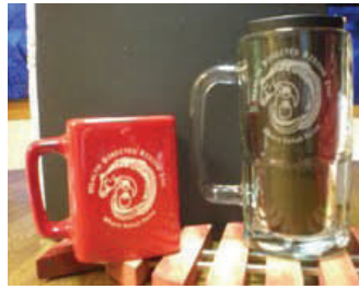
Health Directed Riding Mugs available for purchase

Buy $50.00 worth of merchandise and receive a free water bottle.