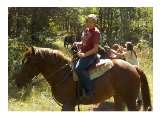
On the trail ride during an amazing fall day at Wild River State Park.